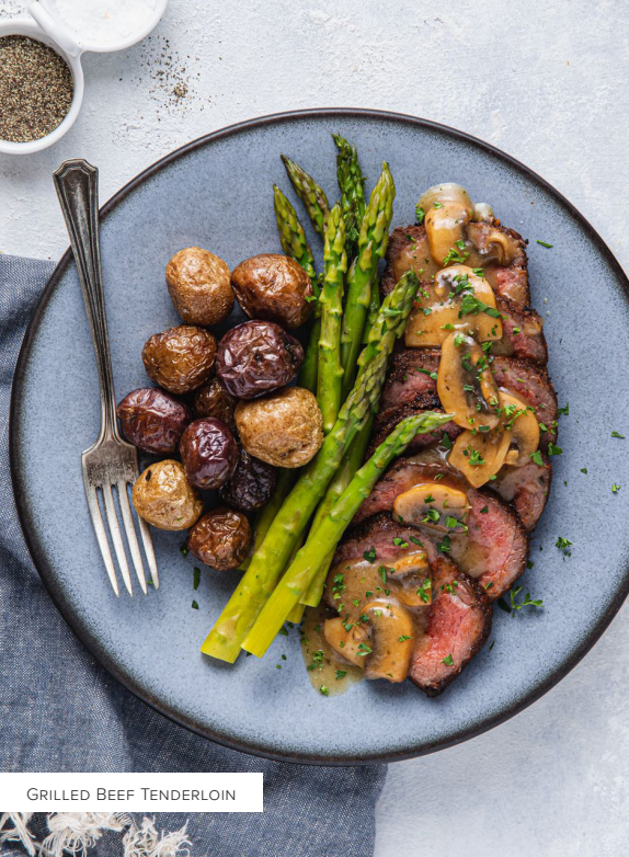
GRILLED BEEF TENDERLOIN