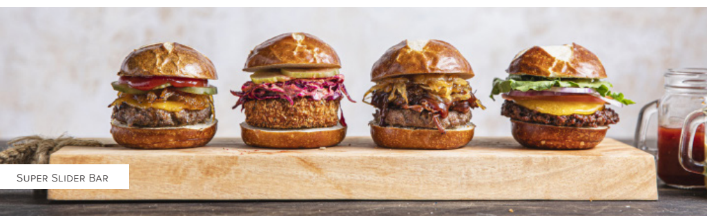
SUPER SLIDER BAR