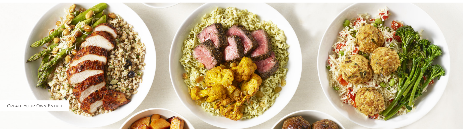
CREATE YOUR OWN ENTREE

Use promo code MSC40 to receive $40 off $400