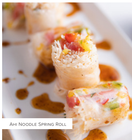
AHI NODDLE SPRING ROLL

Chicken or tofu in a mirin and rice wine vinegar marinade, with daikon, julienne peppers, carrots and cucumbers and green leaf lettuce served with a ginger soy dipping sauce