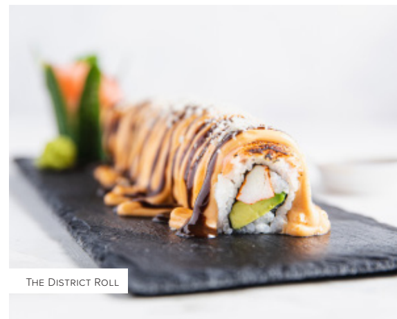
THE DISTRICT ROLL